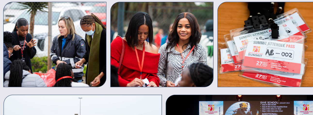
Youth in Oil and Gas Summit -